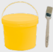
8-11400034 SGG Tyre paste container with brush (5 kg)