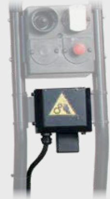
8-12120025 RC TROLLEY 2.4 Radio remote control with 16 channels