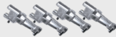
8-12100155 PA Extensions for self-centring chuck up to 58"