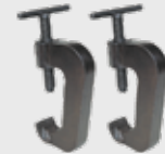
801271597 MV Pair of bead clamps for split rim wheels

For further accessories, see separate catalogue