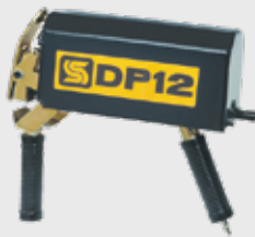
2201677 DP12 Pneumatic bead pressing device