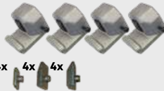
8-12100156 GL Jaws for alloy rims with special plastic inserts